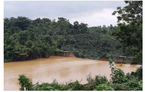
A dam, over four metres in height, keeps the water in a reservoir.

The project has prevented 26,452 tonnes of carbon emissions.