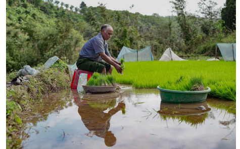
Hydropower regulates water for agriculture in La La village.