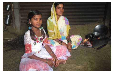
Sept 2017: Before they had to cook on a simple cook stove and collect firewood. Cooking with biogas is now faster and cleaner.