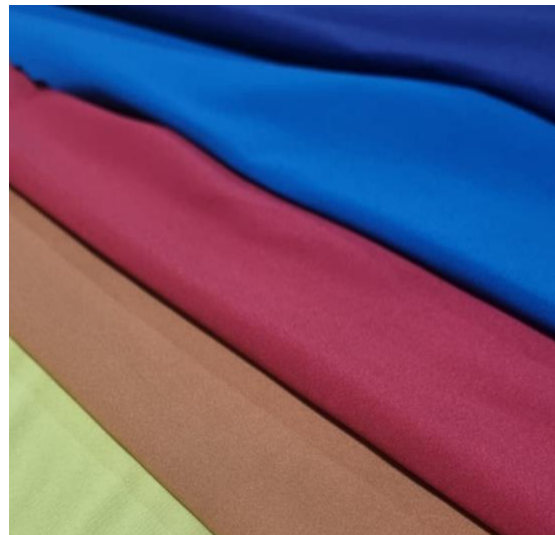
Maglificio Ripa with a selection of both sporty and swimwear articles; all made with GRS certified yarns together with ROICA™ EF.

ILUNA GROUP with its fully certified Green Label collection of laces designed for both sports and fashion, featuring blends of GRS synthetic fibers, FSC certified viscose, and the recycled ROICA™ EF.