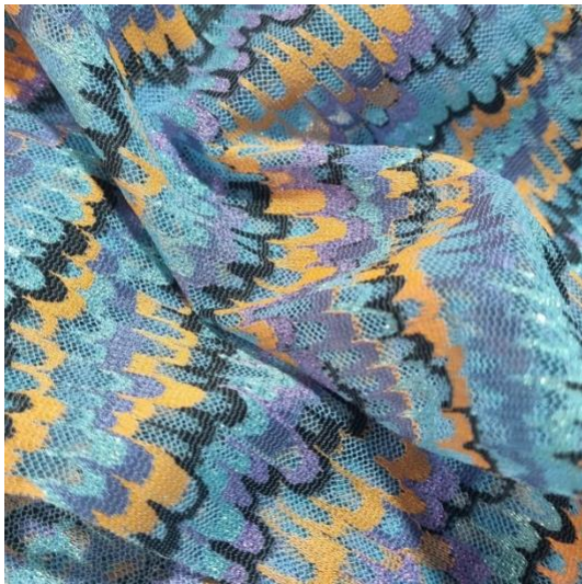
E0115P21 from Iluna Group – 53% Rec. PA 27% ROICA™ EF 17% FSC VI 4% ME

INNOVA FABRICS with the athleisure fabrics realized using our ROICA™ V550 together with Sensil Biocare by Nilit, a degradable polyamide in marine environment.