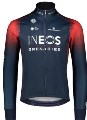
Icon Tempest Jacket by Bioracer with Sitip Fabric containing ROICA Colourperfect™

One of the standout pieces is the ICON TEMPEST JACKET by BIORACER, a company renowned for engineering performance-driven apparel. This jacket, part of the ICON TEMPEST line, is crafted with 90% Sitip BLIZZARD PLX STONE fabric where the printed fabric is made with ROICA™ V550 and the plain and brushed ones are made with ROICA ColourPerfect™ family. BLIZZARD is a 4-way high thermal fabric with an ultra-soft brushed microfiber backing. It provides long life stretch, best fitting and comfort, best breathability and high pilling resistance, easy care. Particularly suitable for winter active and urban-wear garments, pants and tops. Acquazero Eco is an innovative fluorine-free water-repellent textile finishing technology combined with BLIZZARD fabrics. It provides long lasting washing resistance, low impact on breathability and a good laundry-air-dry (LAD) behavior.