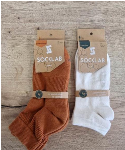
Socks by Socklab by Interloop Europe with ROICA™ V550

The “W” Athleisure line extension from Wolford includes Cifra WKS outfits realized with Econyl and ROICA™ V550. Super resistant and comfortable outfits made for yoga and sportswear activities. Cifra WKS technology allows the body-mapping application: different functional and aesthetic areas placed following the design without ANY seams. Thanks to body mapping it is possible to place, where is needed, areas for transpirations, or areas that can offer more support and compression, and areas featuring purely aesthetic structures without any transitional sewing. This leads to realize a perfect balance between design and functionality, where outfits with an exclusive and customized pattern are also following body shapes in a way to offer super comfort and efficiency. Outfits made with WKS technology are knitted in one piece, with grown-on sleeves, gloves. WKS is a sustainable process, both in terms of technology and materials. WKS technology allows a zero-waste approach thanks to the significative reduction of room’s scraps and the full consumption of the loaded yarn.