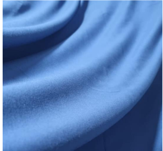
PARIS SPECIAL from Innova Fabrics – 86% Lyocell Tencel 14% degradable ROICA™ V550

BRUGNOLI with a high performing fabric with degradable values given by ROICA™ V550 and the Amni Soul Eco polyamide.