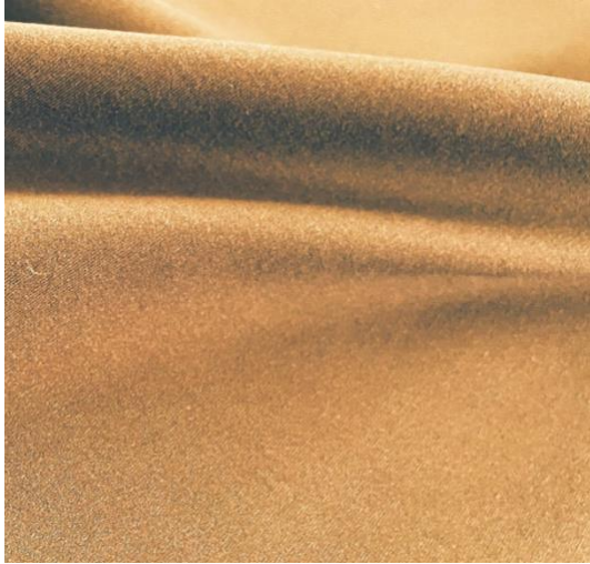
Fabric from Brugnoli - Amni Soul Eco with degradable ROICA™ V550

BRUGNOLI with a high performing fabric with degradable values given by ROICA™ V550 and the Amni Soul Eco polyamide.