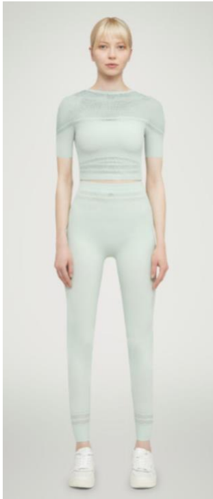
A seamless garment from the “W” Athleisure line by Wolford made by Cifra WKS with ROICA™ V550.