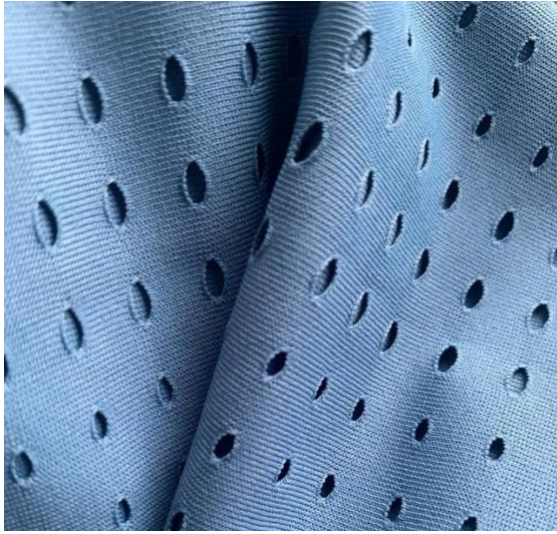
13491 from Penn Textile Solutions/Penn Italia – 76% Rec. PA 24% ROICA™ V550

PENN TEXTILE SOLUTION/PENN ITALIA A sporty fabric made with GRS certified polyamide, and ROICA™ V550.