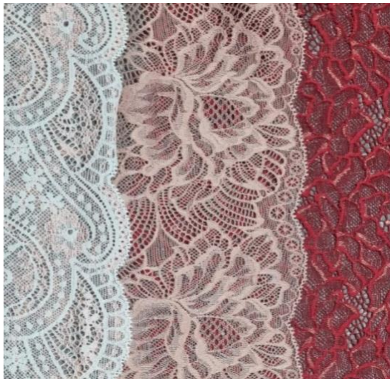
Tessitura Colombo Antonio with its selection of 3D-effect laces all made using ROICA™ V550.

SITIP and its BLIZZARD fabric made with polyamide and ROICA™ V550 yarn. A 4-way high thermal fabric with an ultra-soft brushed microfiber backing.